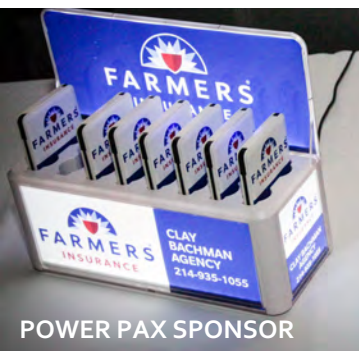
POWER PAX SPONSOR