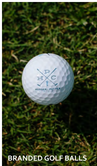
BRANDED GOLF BALLS