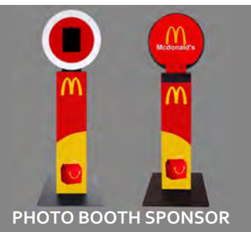
PHOTO BOOTH SPONSOR