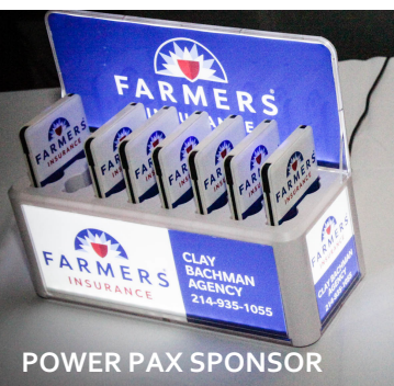
POWER PAX SPONSOR