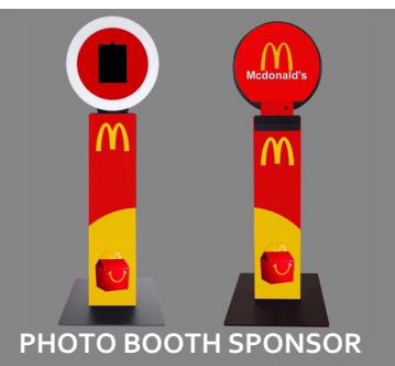
PHOTO BOOTH SPONSOR